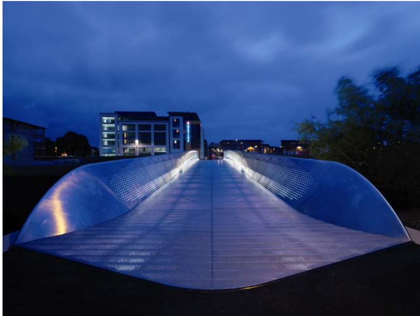
Fig. 7. Meads Reach Bridge, Bristol, UK (Fabricator: www.m-tec.uk.com )