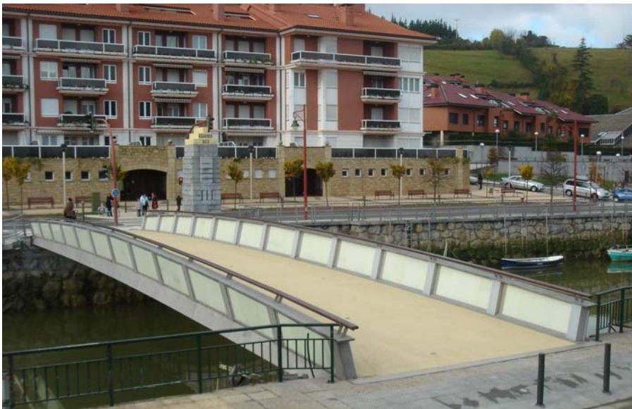
Fig. 5. Zumaia Pedestrian Bridge