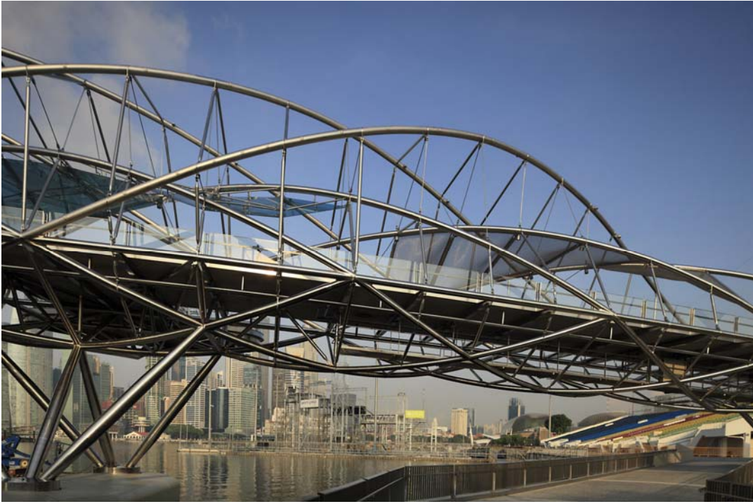
Fig. 4. The Helix, Marina Bay, Singapore