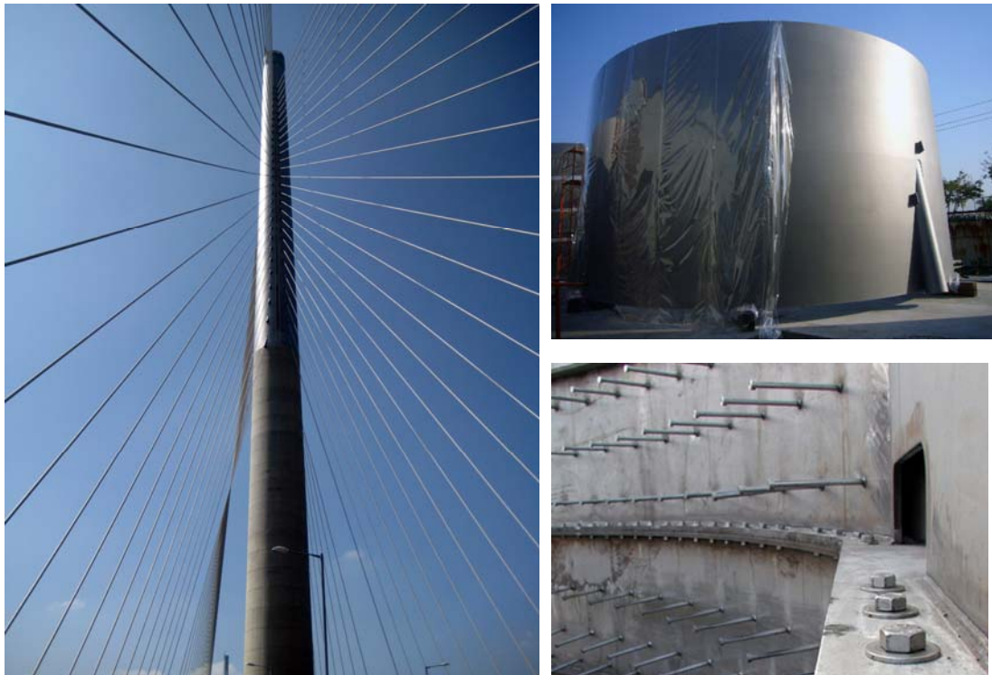
Fig. 3. Stonecutters Bridge: monotower and stay cables (left), segment of skin (top right), shear connectors on side of tower segment (bottom right)