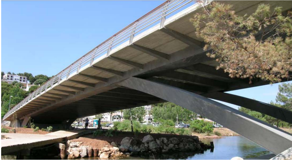
Fig. 2. Cala Galdana Road Bridge, Menorca