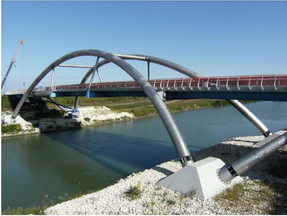
Fig. 6. Piove di Sacco Bridge under construction, Padua, Italy