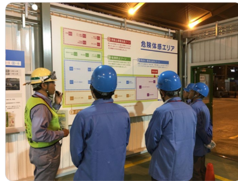
Description of the experience area