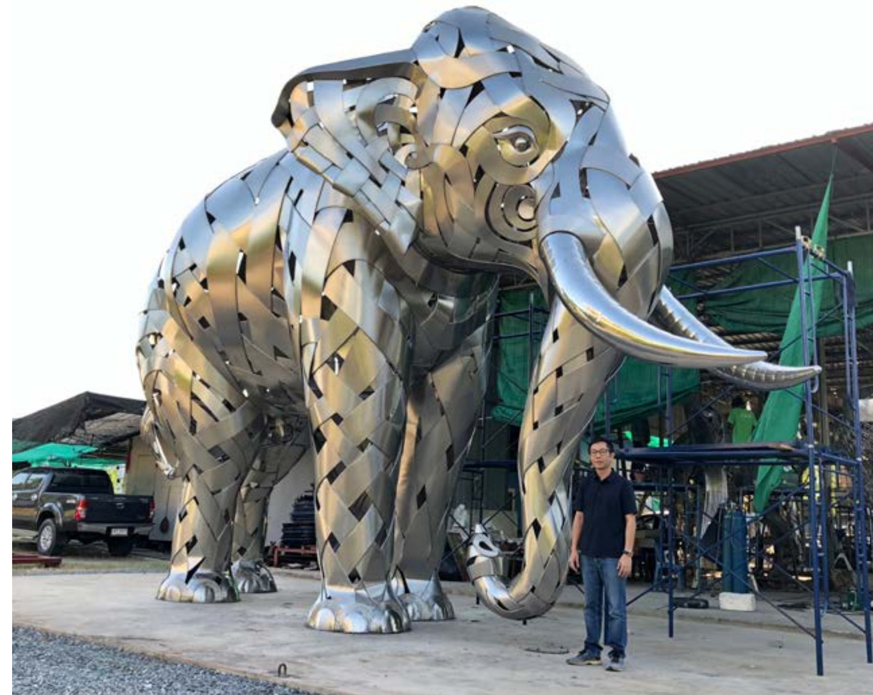
Kotchasarn Artwork sculpture Picture © Somsak Kongnapakdee