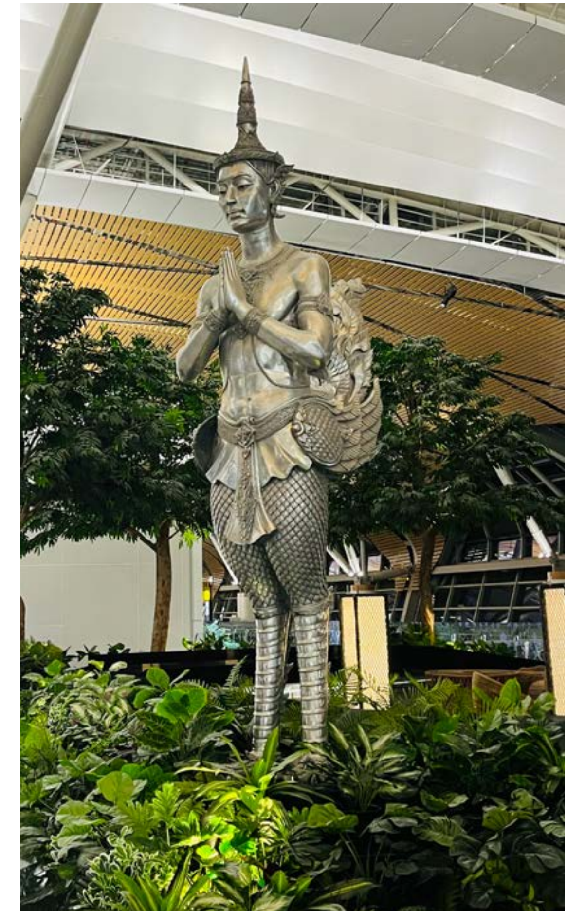
Kinnara Artwork sculpture