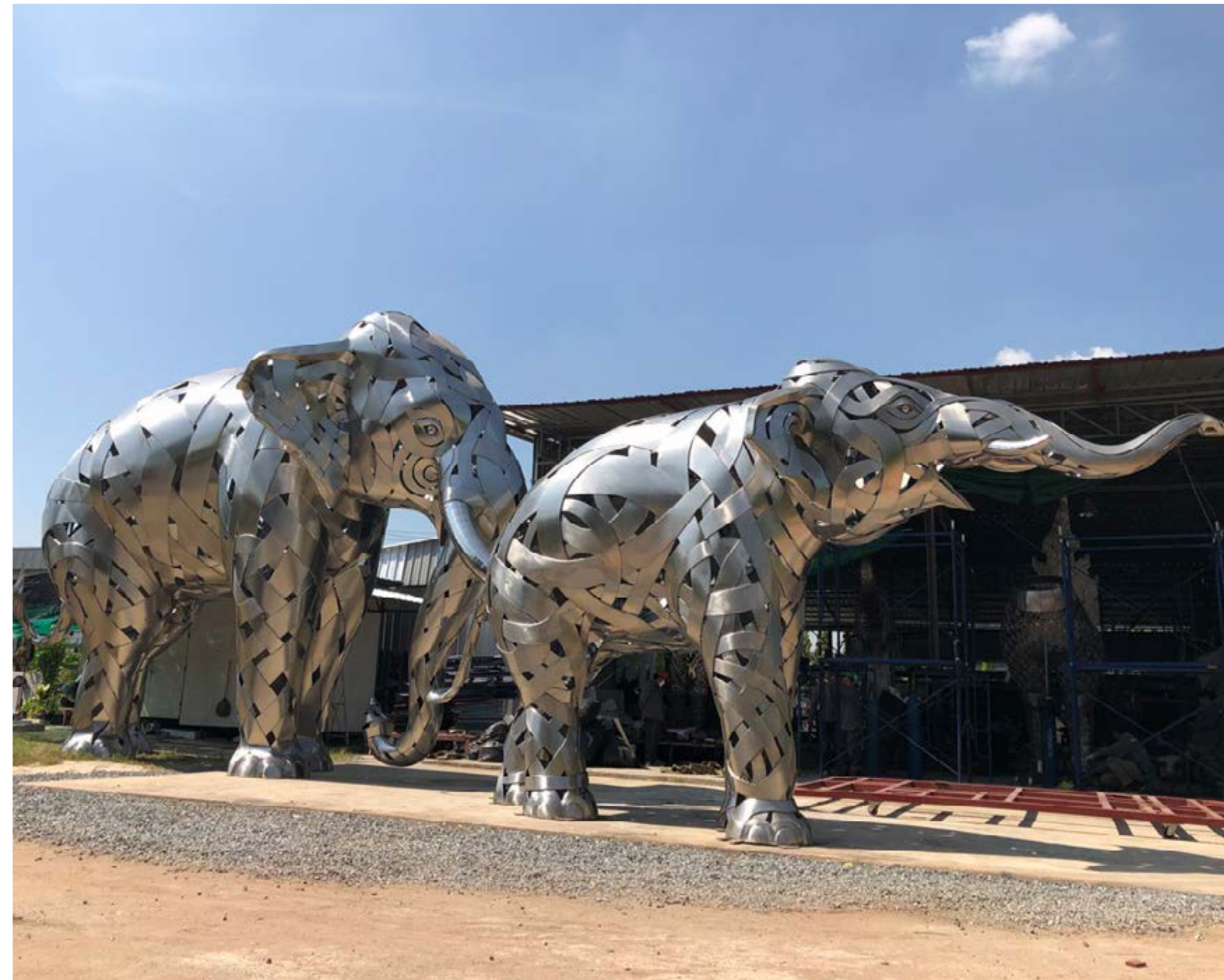
Kotchasarn Artwork sculpture