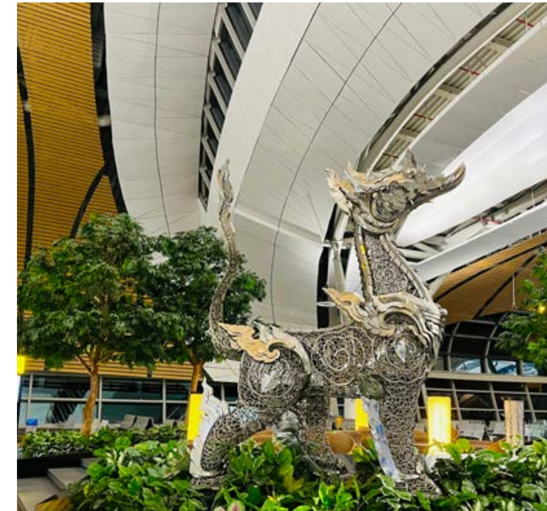
Hemaraj Artwork sculpture