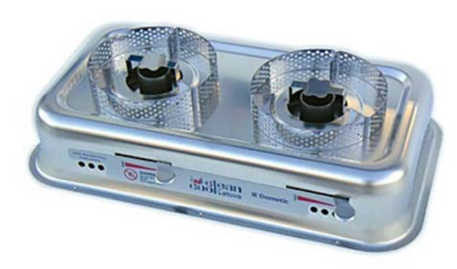
Ethanol cooking stove.

Other fuels include alcohol (methanol in liquid or gel form), locally produced biogas, liquefied petroleum gas (LPG) and compressed natural gas (CNG), for which stainless steel-containing equipment is also available.