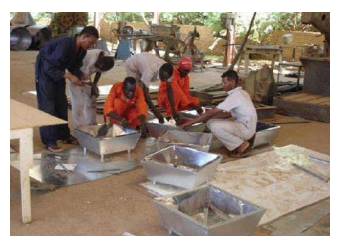
Solar box cookers. Source: Solar Energy Enterprise Co. Ltd. (Sudan), v