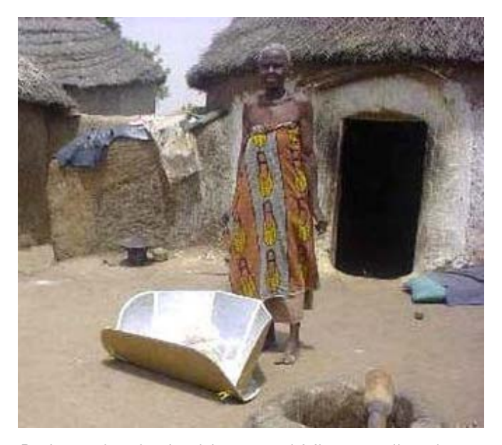
Basic panel cooker involving a metal foil on a cardboard support.

Panel cookers depend on the same physical principle, but, they involve foldable reflectors. Experience shows that they can produce temperatures of 120 °C to 180 °C (approximately 200 to 300 F). Basic models are common in developing countries; but the principle has also spread to industrialised countries, where the "hot pot" has become a lifestyle article.