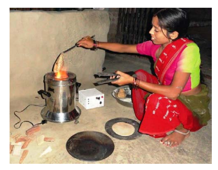
Forced air stove with electrically powered fans and rechargeable batteries for use with photovoltaic cells.

The 50% lower fuel consumption, together with shorter cooking times, lead to a 70% reduction in smoke compared to simple open stoves. The enhanced combustion also minimises particulate matter formation and the unsightly blackening of kitchen walls and cooking pots.