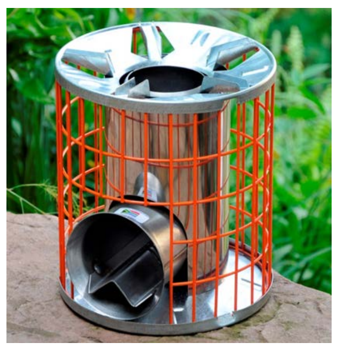
L-shaped combustion chamber of a rocket stove, assembled (above) and as delivered in a flat pack.

Rocket stoves include an L-shaped combustion chamber. Their design improves heat transfer by narrow channels, which direct the flow of hot gases closer to the pot.