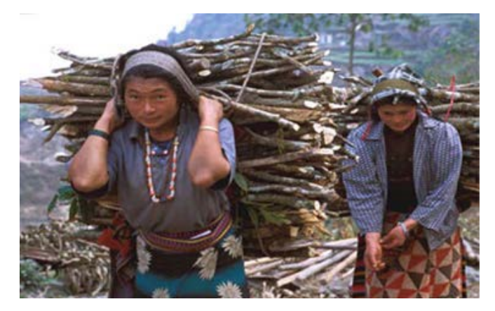
Typical health risks: exposure to smoke and the collection of fire wood.

In many countries, charcoal is a usual cooking fuel. The unsustainable collection of wood for charcoal production has led to native forests being stripped. Landslides and desertification are among the catastrophic long-term consequences of this practice.