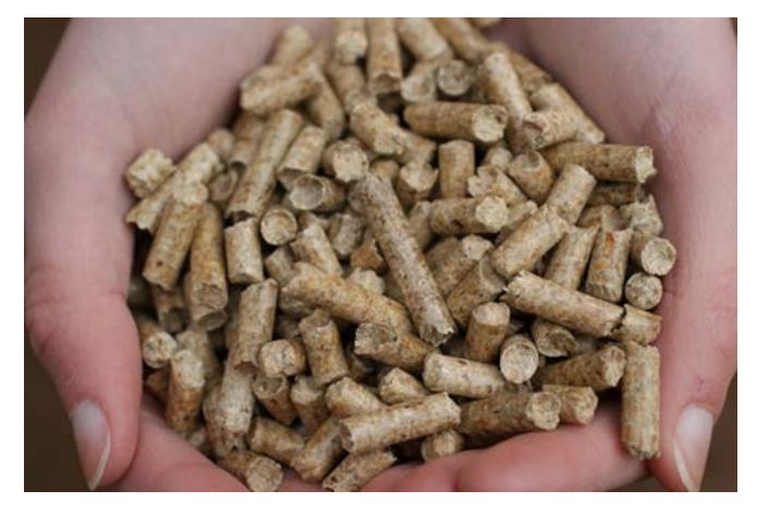
Pellets made from waste wood.