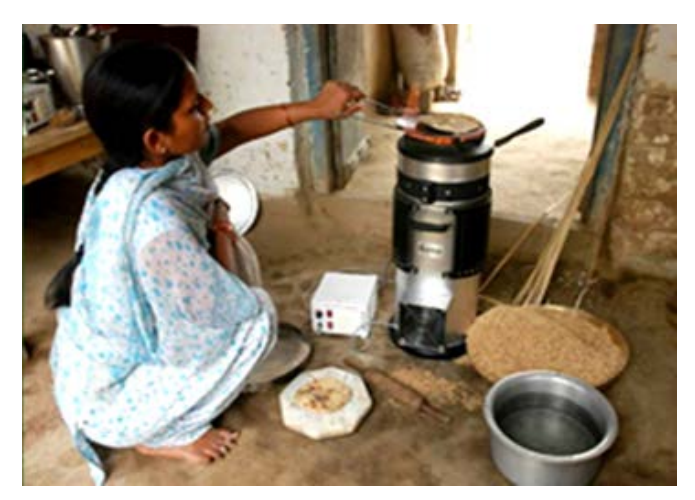
Rice Husk Gas Stove.

Some types of stoves are optimised for particular types of fuel. An example is an Indian product, which is designed specifically to burn rice husk. It is a batch-type, top-lift updraft (TLUD) gasifier stove.