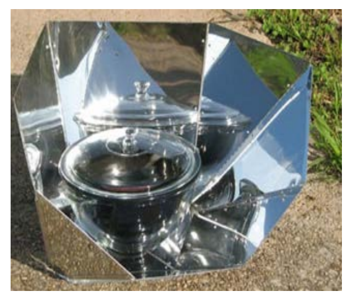
All-metal panel cooker.

In the case of box cookers, the lid is made of a mirror-like material. It reflects the solar radiation into a blackened box, into which the cooking pots are placed. Box cookers are bigger and less portable than panel cookers, however, larger models can hold several cooking pots. The temperature range is typically between 180 °C and 200 °C (about 350 to 400 F).