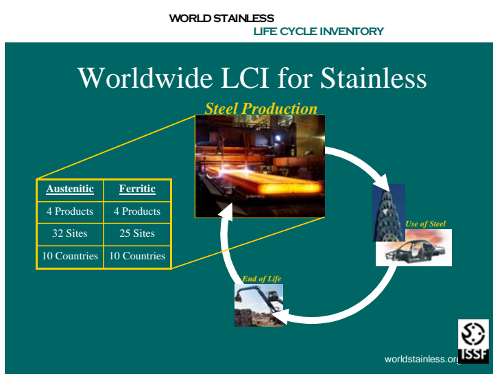
Figure 3 summarizes the input to the global LCI for stainless steel