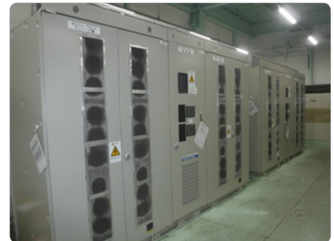
New device (IGTB element)

element, we achieved a reduction in the annual power consumption as follows. Annual power Consumption Previous device (GTO element); 5,478MWh New device (IGBT element); 2,451MWh Therefore, we can now save 3,027MWh of energy.