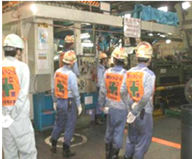
1. Inspection patrol

An activity case is shown in the pictures below.