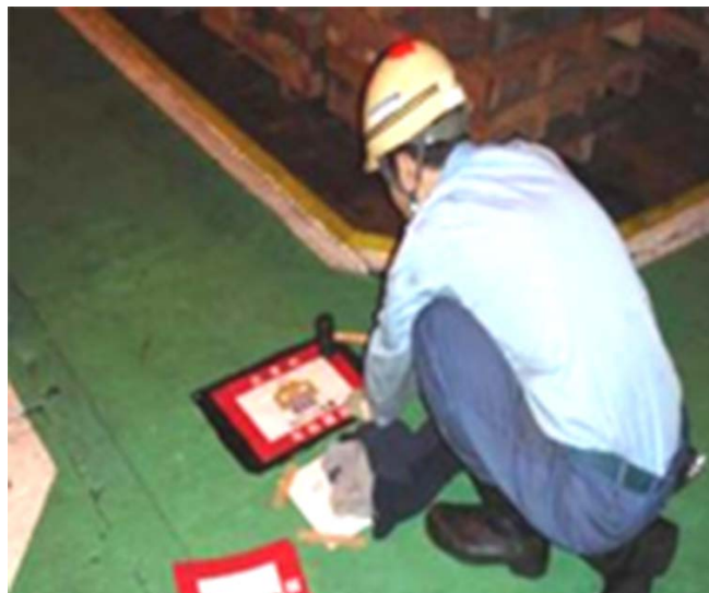
4. Setting warning sign