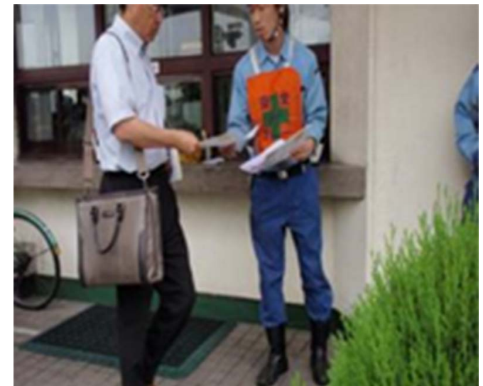
5. Guideline development and distribution