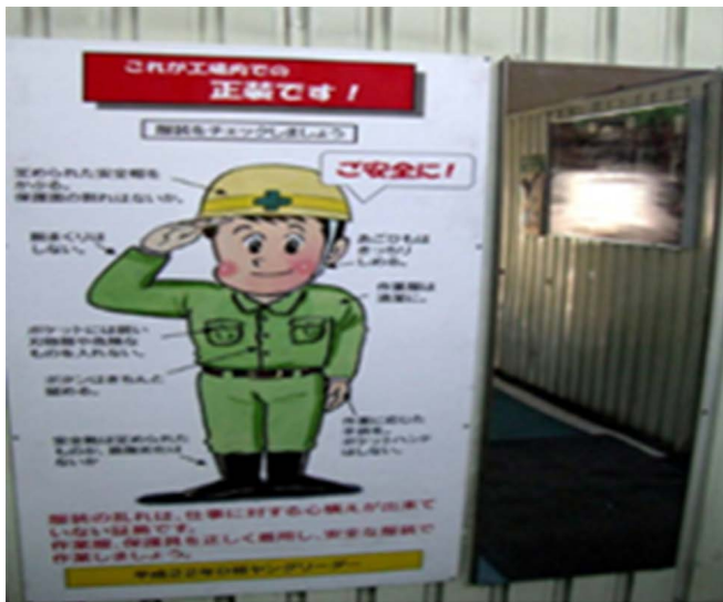
3. Confirmation grooming mirror