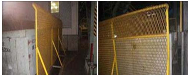
Before: fence is hard and heavy to move

is a risk for falling and pinching during the movement). On the right side the fence is installed in contact with the passage. When material is being transported, it gets in the way and there is a potential risk of overturning. After the improvement it became easy to move the fence without any effort and there is no barrier when the material needs to be transported.