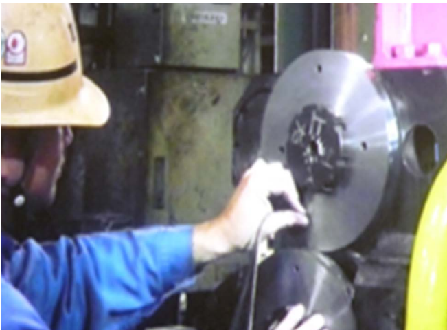
Shear cutting blade exchange