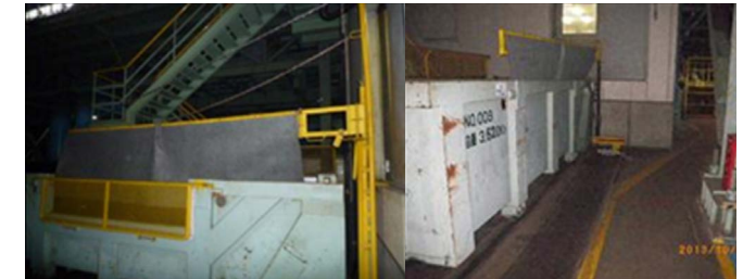
After: fence is easy to move