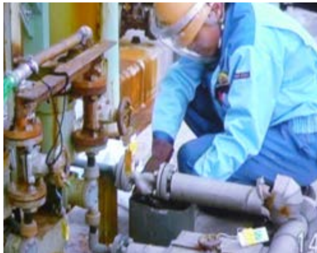
Wastewater treatment facility cleaning