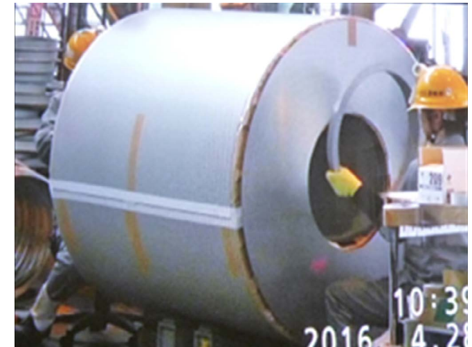
Export packing work