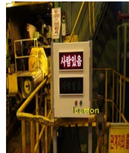
Situation after: before entering the cellar, turn on the light

Actually, accidents have occurred rarely in our company, but safety has been strengthened further for workers, which can prevent any possible accidents. Also, it can prevent unauthorized person from gaining access to the cellars through recording information.