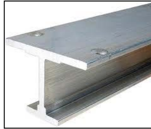
I-beam from plate