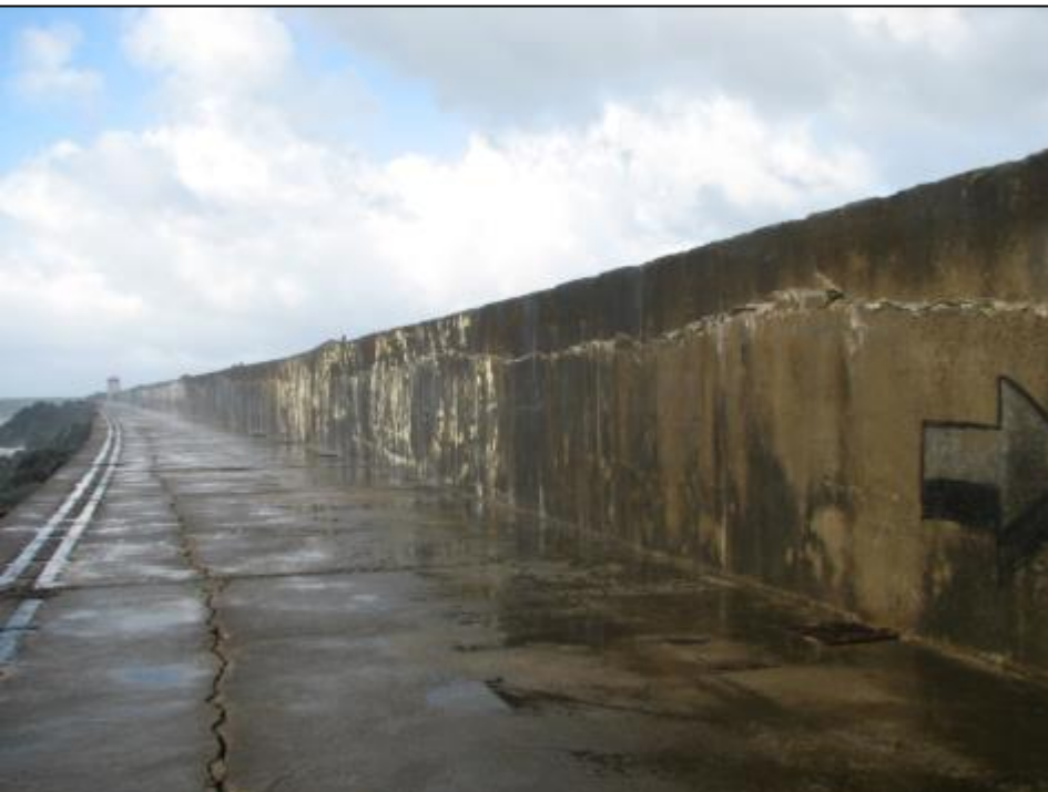
Cracks on the deck and wall required repairs

On the river side a 7m wide platform allows the heavy-duty cranes to lift the blocks