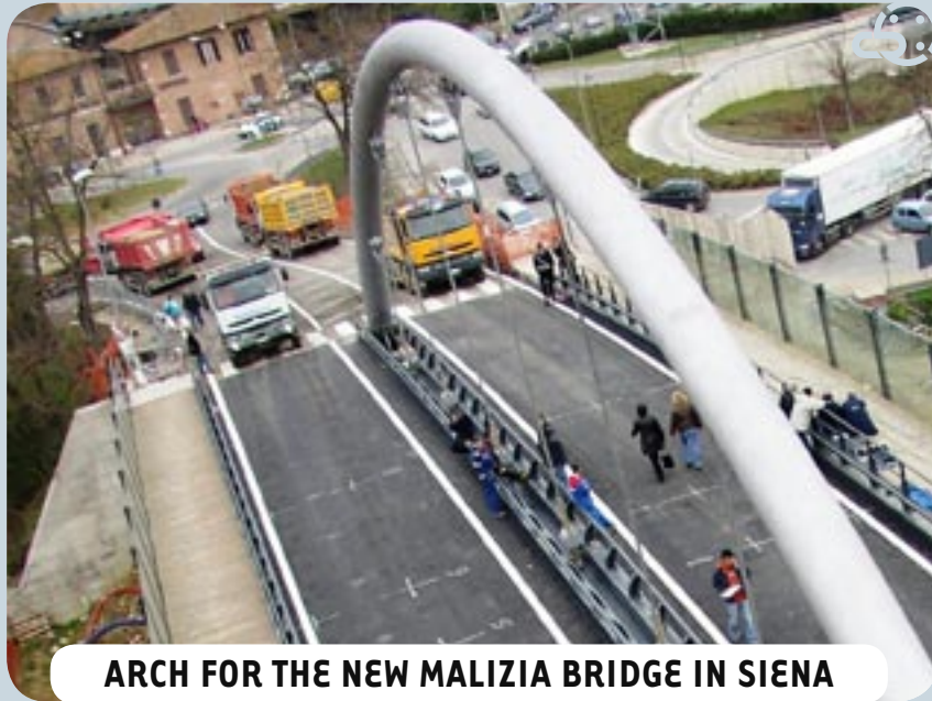
ARCH FOR THE NEW MALIZIA BRIDGE IN SIENA

The reconstruction of the Malizia bridge arose from the need to improve traffic flow and the wish to create an important new architectural feature for Siena. The durability, formability and corrosion resistance properties of stainless steel were attractive. A functional and technologically innovative solution for the bridge, which crosses over the railway, was found in the construction of a large arch, between the two previously built carriageways.