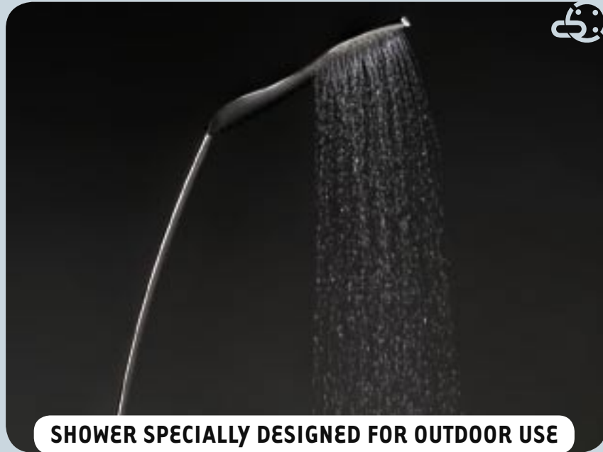
SHOWER SPECIALLY DESIGNED FOR OUTDOOR USE

This shower is usually installed at leisure areas (e.g. at swimming pools or in a garden) in various environments (seaside, rural, urban, industrial, etc.). In such environments, both superior mechanical resistance and corrosion resistance are important to assure durability. Stainless steel was selected because of these attributes.