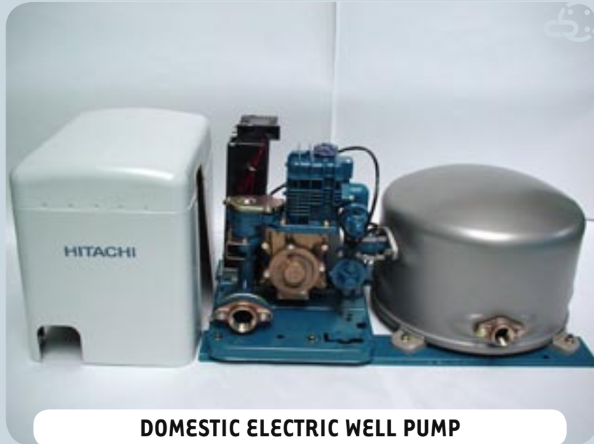
DOMESTIC ELECTRIC WELL PUMP

The use of well pumps is especially common in rural areas, for watering flower beds and vegetable gardens. To enable cost-effective mass production of these pumps, the designers selected a modified type SUS XM7 stainless steel. The alloy composition and special surface treatment of this stainless steel made it the softest available austenitic grade. Its use in the pump has also demonstrated the excellent workability of this material for other deep drawing operations.